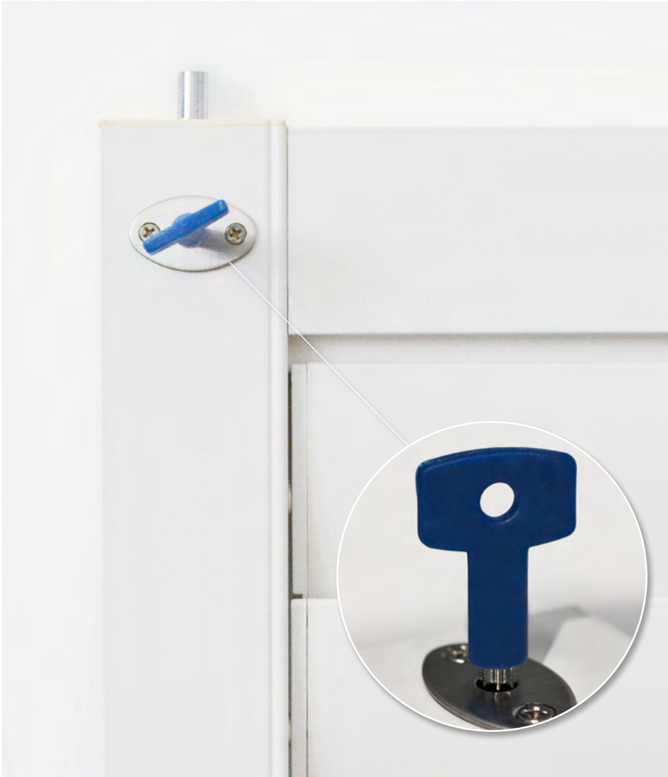
SECURITY BOLT Available for Weatherwell Standard