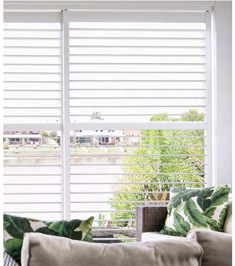
114mm - Opened