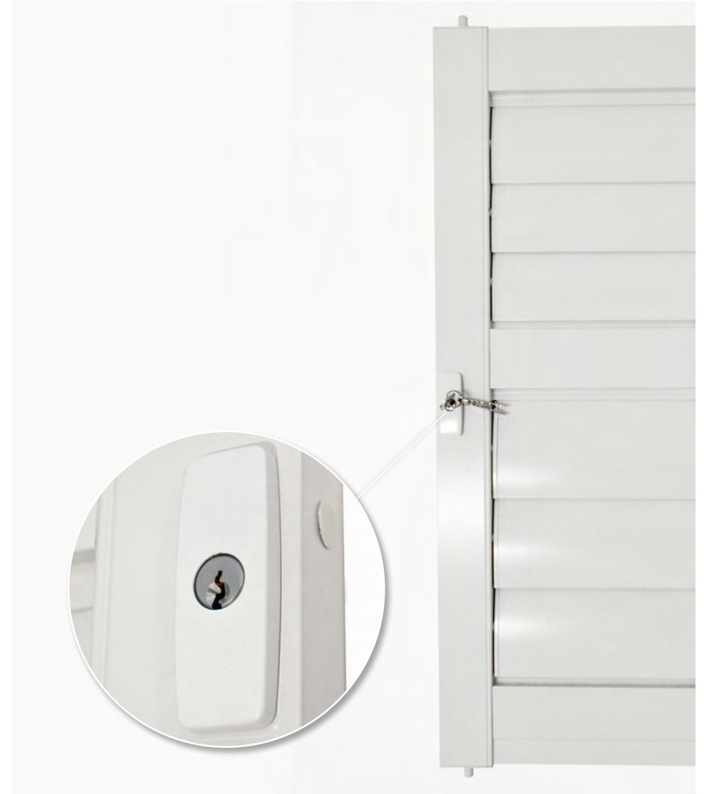
DOUBLE SHOOT BOLT Available for Weatherwell Standard