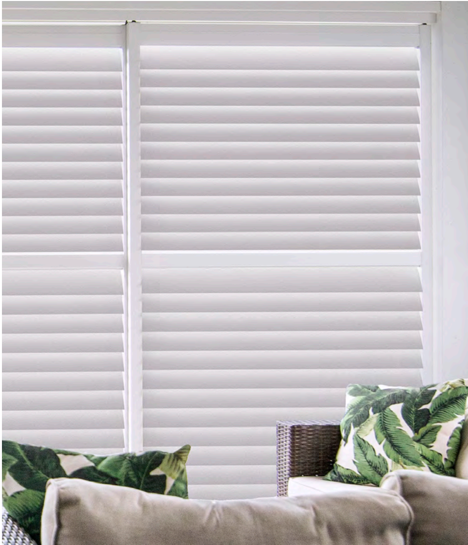
114mm - Closed Available for Weatherwell Standard