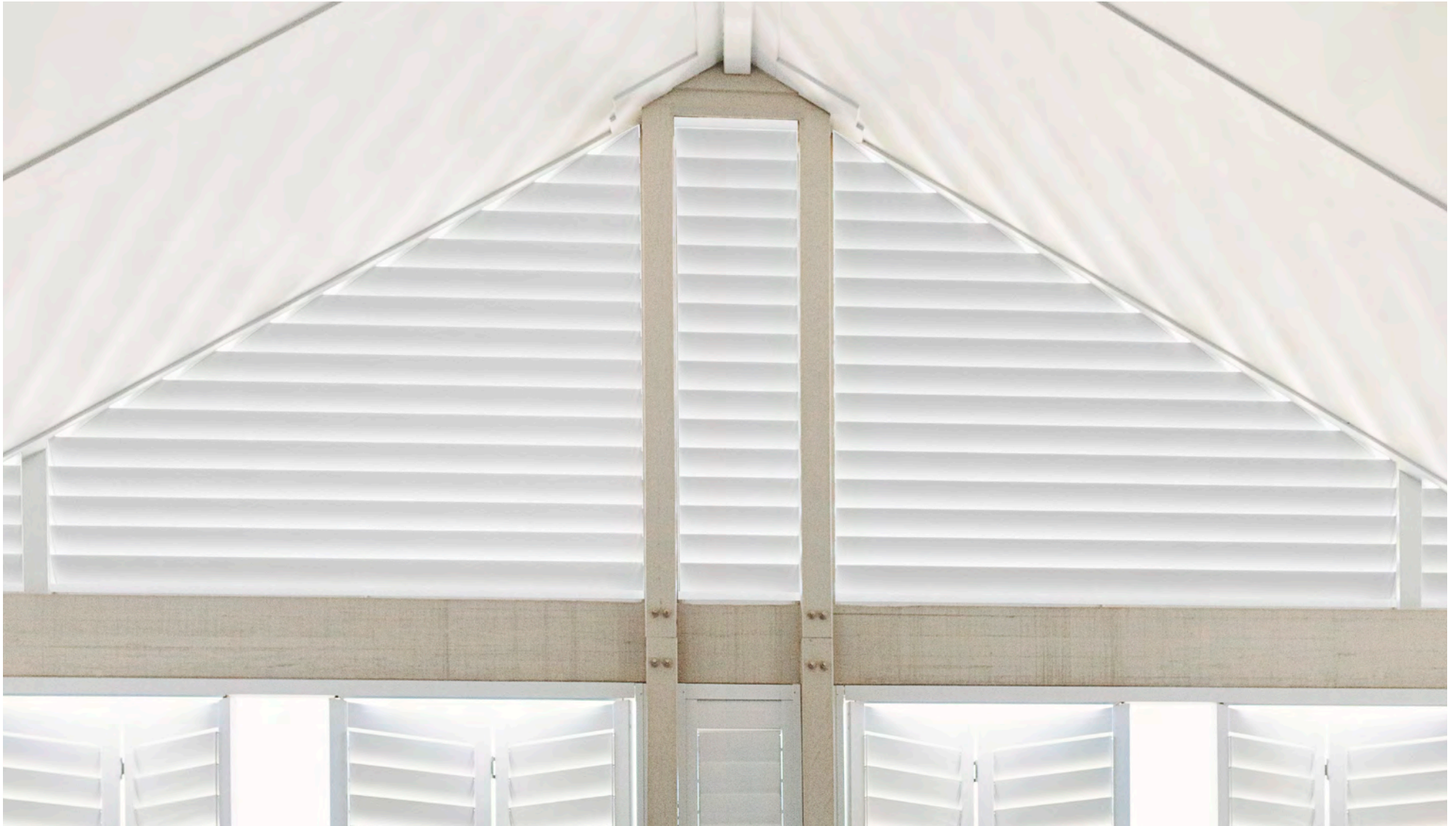
Pictured: Weatherwell Fixed Louvre